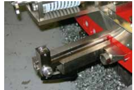
All new trip design features a breakaway mount to prevent frame damage. Remote control feed trip is optional