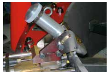
Optional patent pending counterbore and reverse beveling module bolts to tracking slides to deliver perfect preps