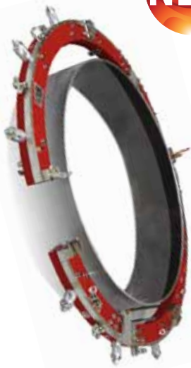
LDSF Split Frame