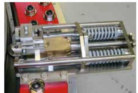
The LDSF includes heavy duty O.D. tracking slides to compensate for out of round pipe and vessels and setup